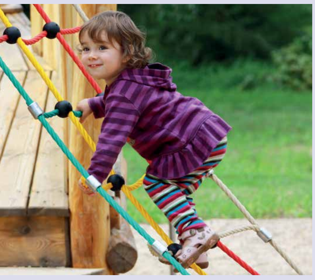
space and equipment, especially for climbing, than you can provide at home