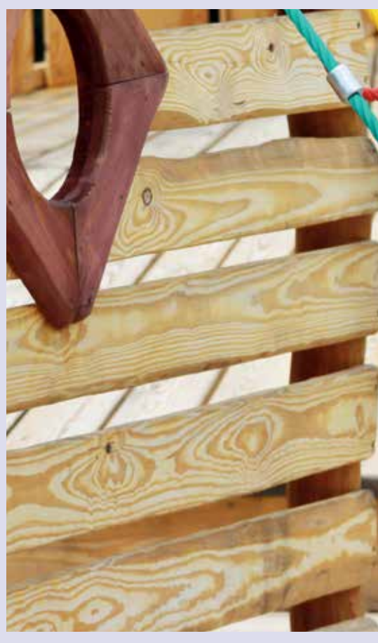
Parks and playgrounds are likely to have more

Children gain hugely in confidence during physical play. You may find that your child often wants to show