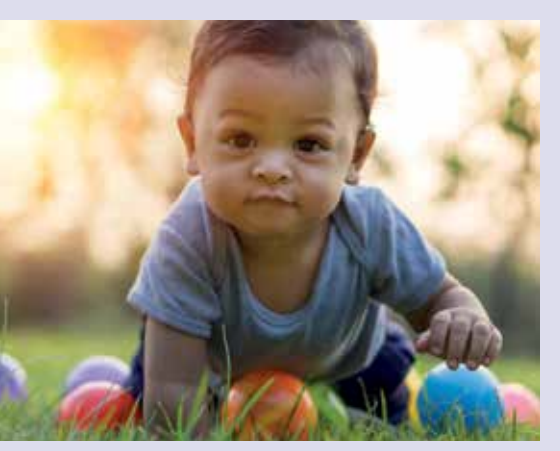
Physical play starts at the earliest age

Physical play encourages children to move in a variety of ways. In doing so, children's heart muscle is