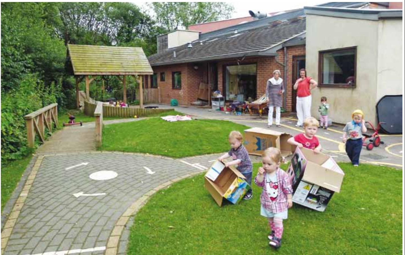
At Grandpont in Oxfordshire, the outdoor space includes winding paths, varied surfaces and both natural and man-made materials