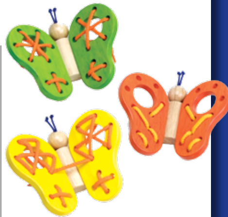
Left: Eduzone's Wood Farm Sequencing. Above: Early Years Direct's Lacing Butterflies. Below: Yellow Door's Twisty Droppers

goo for children to run their fingers through, squeeze and pour.